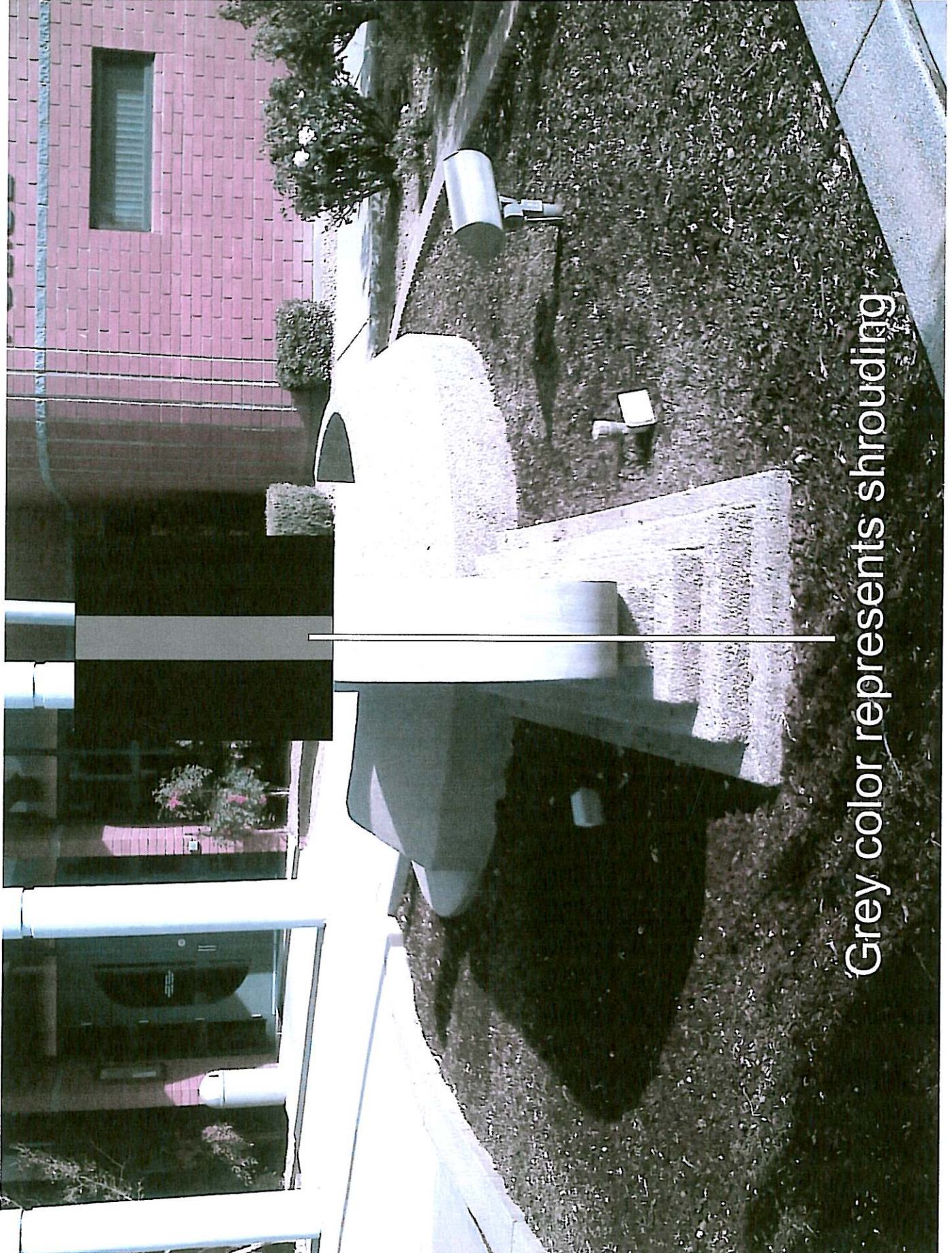
Grey color represents shrouding